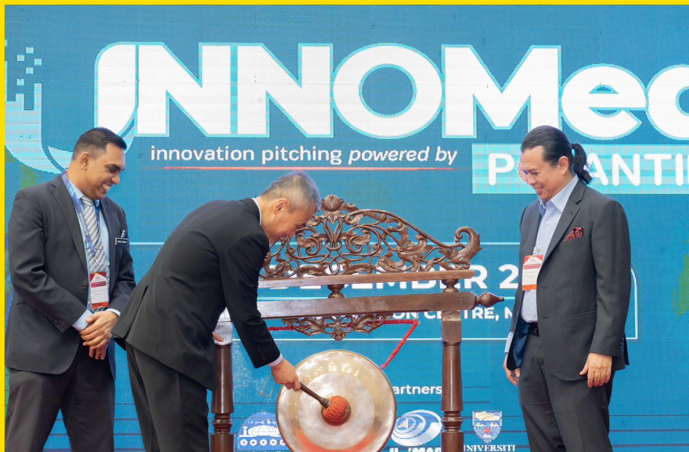
MAJLIS PERASMIAN INNOMED