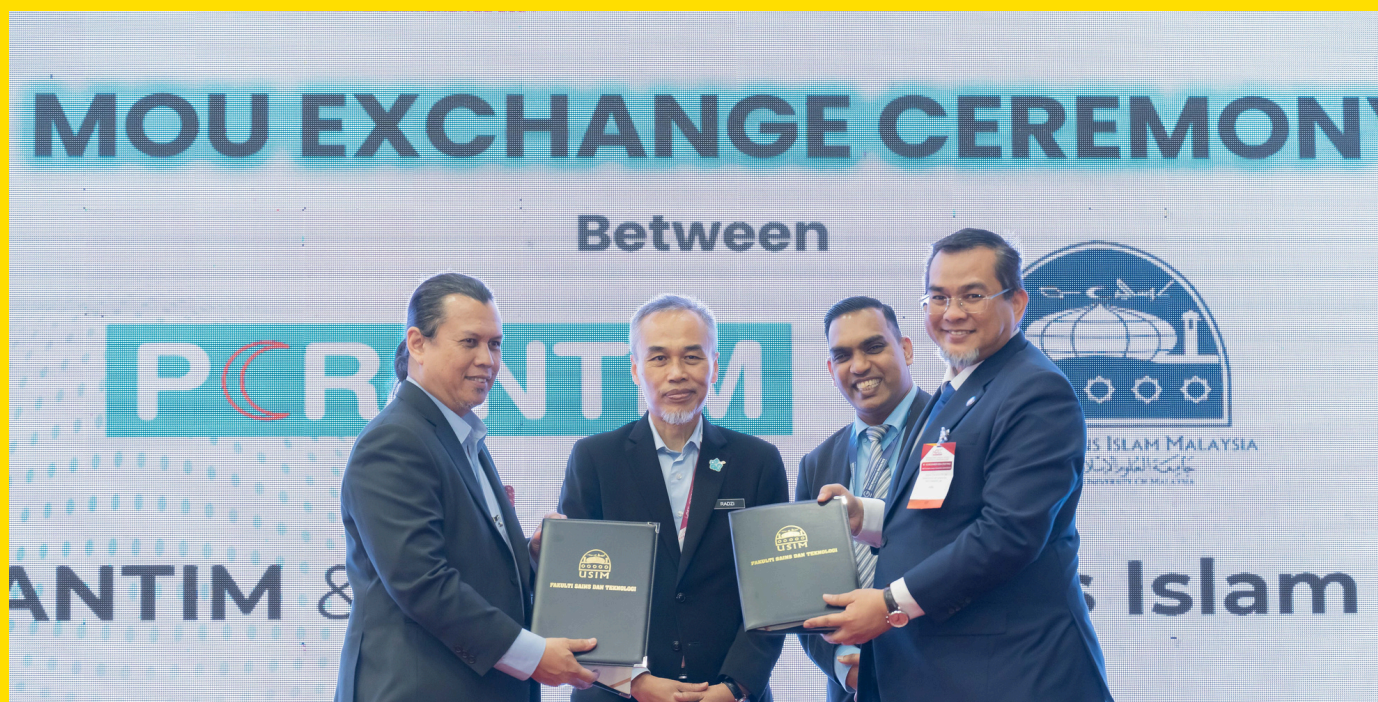
PERTUKARAN MEMORANDUM DI ANTARA PERANTIM DAN KOLEJ UNIVERSITI